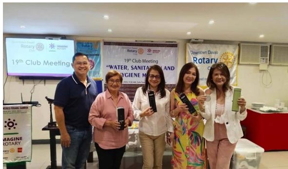
Early Birds of the Day!