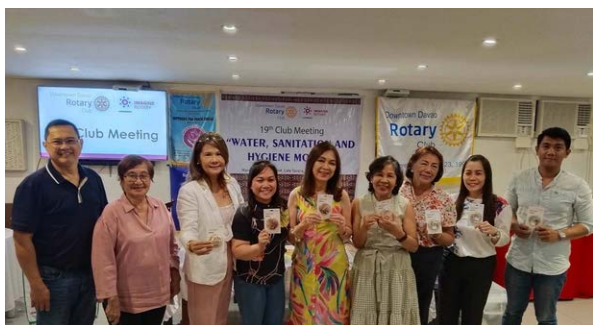
Dreamers Barkadahan has the highest attendance of the day.